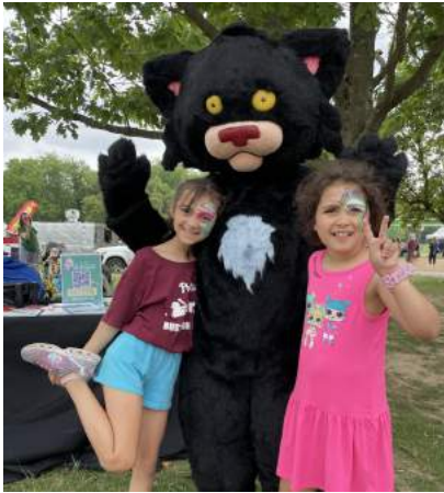
Attendees to Mondauk's 40th anniversary celebration snapped photos with the notorious Bad Kitty.

We thank our presenting sponsor Volvo Cars of Fort Washington for their generous support of Celebrate Summer in UDT! . We would also like to recognize Acts Retirement-Life Communities and our other sponsors for helping to make it possible!