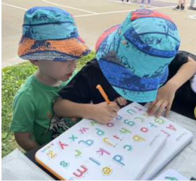
Two brothers practice writing their letters with our Learning Letters Magnatabs. Available to borrow from the UDPL's new Library of Things.

Even before the official first day of summer arrived, the UDPL was in full celebration mode. We are delighted to be a part of Celebrate Summer in UDT! in partnership with Upper Dublin Parks & Recreation. Following the success of the last two years branded as Celebrate Summer @ 520 , the series has been expanded this year with new events to be hosted in various locations throughout Upper Dublin, and this new name to match. Celebrate Summer in UDT! kicked off on Saturday, June 3 with a special 40th-anniversary observance of Mondauk Common, UDT's beloved and most-visited park. Visitors to the Library table were introduced to the Library of Things among other programs. The mischievous storybook character Bad Kitty even made an appearance.